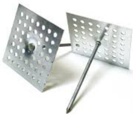
Pin Style Insulation Anchors

TemperTherm 100% Polyester Carpark & Soffit insulation panels are recommended to be installed using mechanical fixings. These can be either shot fired insulation anchors (such as Hilti or Ramset) or the insulation pin style insulation anchors with one-way washers or domes.